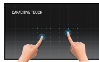
Touch technology - Capacitive

Thanks to Android OS, you can easily customize the display to your needs by installing applications directly to it.