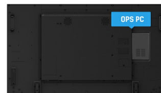
OPS PC SLOT

IPS displays are best known for wide viewing angles and natural, highly accurate colours. They are especially suited for colour-critical applications.