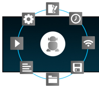
Android İşletim Sistemi

This ELED VA display consumes significantly less power compared to DLED IPS while maintaining the same level of brightness. Its versatile orientation, sleek design, and 24/7 reliability ensure it seamlessly integrates into any business environment. Whether it's used in retail, corporate, hospitality, or educational settings, the LH6560UHS-B1AG will undoubtedly captivate your audience and leave a lasting impression.