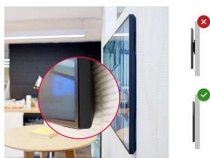
Zero-Gap Wall Mount

Designed to perform in continual, around the clock environments, the LH4370UHB can be installed and utilised in landscape and portrait orientation. The jaw dropping and best-in-class 25mm total depth (when used with the included proprietary brackets) will mean this display can be installed discreetly and elegantly in all areas.