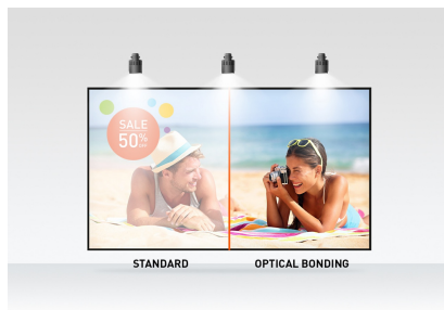
Optical bonded PCAP

The Full HD (1920x1080) Open Frame monitor ProLite TF2438MSC-B1 with IPS panel technology offers exceptional colors and wide viewing angles. The Optical Bonded Projective Capacitive (PCAP) 10-point touch technology ensures a seamless and accurate touch response and a lower light reflection, in addition, the display is protected against humidity and potential moisture development. A robust metal housing and a scratch-resistant 7H edge-to-edge glass with anti-fingerprint coating make the monitor particularly suitable for integration in demanding environments. The monitor meets also a IPX1 protection rating, making it waterproof for a period of time against dripping water. The ProLite TF2438MSC-B1 can be used in landscape, portrait and face-up orientation. A perfect solution for kiosk systems, retail and interactive digital signage installations.