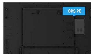
OPS PC SLOT

IPS displays are best known for wide viewing angles and natural, highly accurate colours. They are especially suited for colour-critical applications.